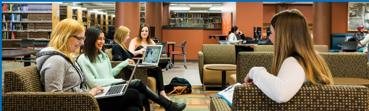
Renovated student space in the Library at Mount Saint Vincent University.

The consortium moved from use of the Pragmatic Conferencing phone system to using Skype for Business as its primary meeting platform. This move saved CAUL-CBUA $2,200 in 2016.